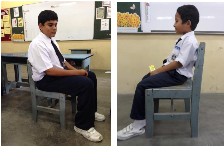
Figure 5 : Indicating a mismatch in the size of the anthropometric student body of different sizes with the existing school chair

Among the types of measures taken during the research process as anthropometric parameters are: