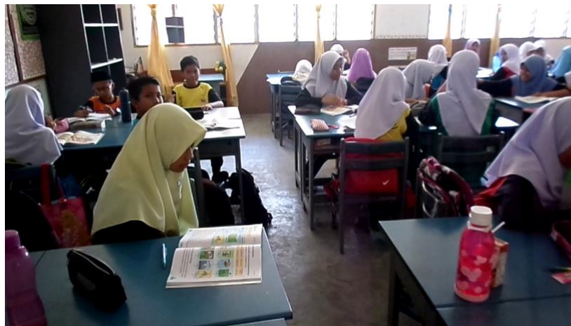
Figure 3: Classroom environment when the learning and teaching sessions are held.