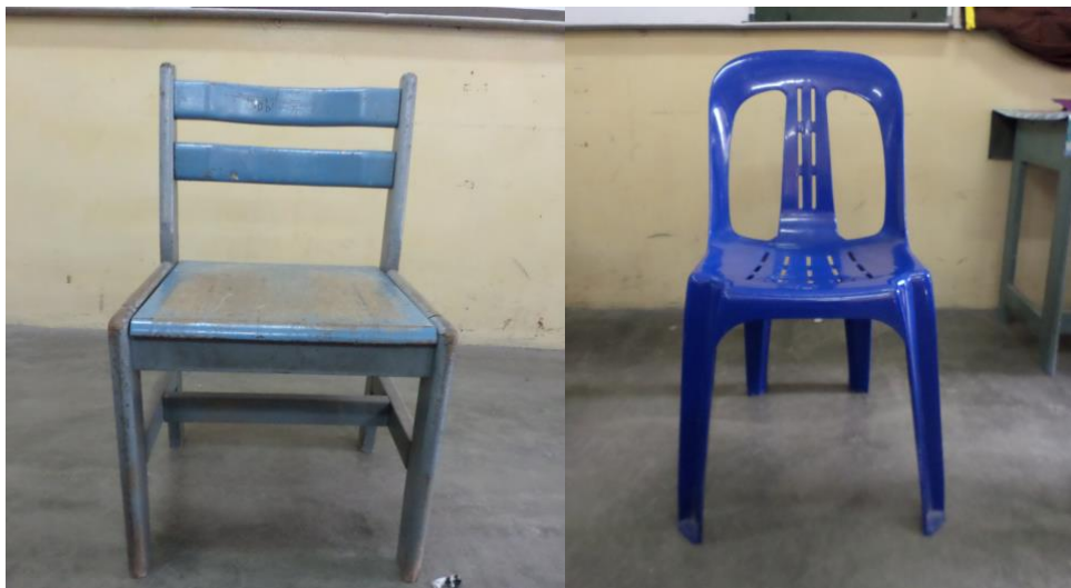
Figure 2: Types of existing chairs that been used in Primary school in Malaysia