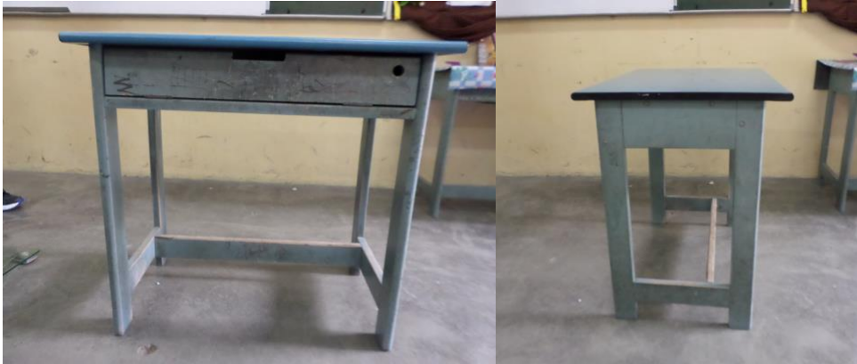
Figure 1: The existing tables that been used in Primary school in Malaysia