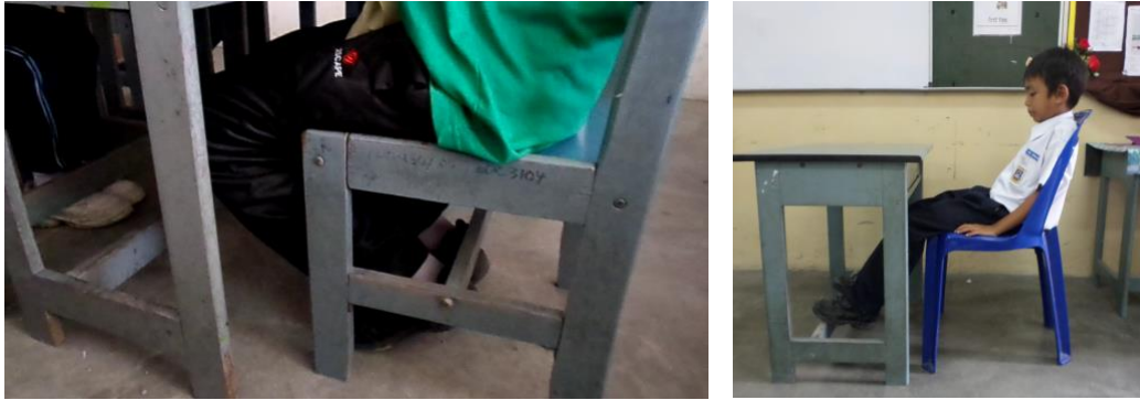
Figure 4: The usage and problems that encountered by students. Big sized students or high chair is not in accordance with the design provided because students felt uncomfortable when seated in a long time.