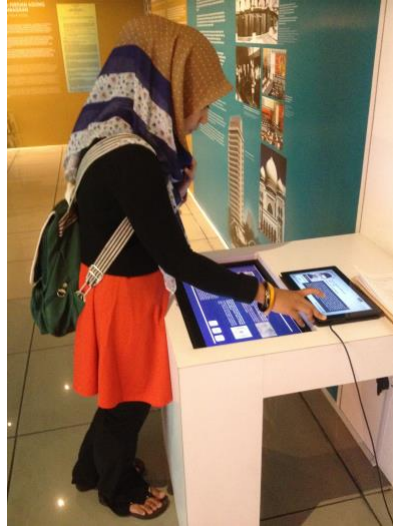
Figure 5. Visitor was evaluating the prototype

of the variables. In total, 104 visitors (N=104) interacted with “The Prime Minister of Malaysia” application and participated in the evaluation. The respondent of the study constituted of 55 males (52.9%) and 49 females (47.1%). By age-group, the highest number of the respondents fall within the age group of 18-24 years old which equals to 41.3%, followed by 34.6% between 25-34 years old, 14.1% between 35-44 years old, and 9.6% over 45 years old.