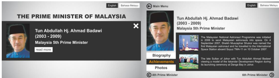
Figure 4. Modified pages of “The Prime Minister of Malaysia”

The application was redesigned using Adobe Flash software. It was designed according to previous application layout, which is 1920 by 1080 pixel screen. Some requirements are set for the proposed design by combining design elements and design principles to create the prototype. Simplicity is one of the main design principles for this prototype as the interface must be comfortable to read and easy to use or navigate. Secondly, consistent interface helps users get comfortable with the application in a short time. The main menu is made clear for visitors to avoid clustered screens and allow them to navigate in better depth. Therefore, visitors can select and understand other prime minister's information in a very short period of time.