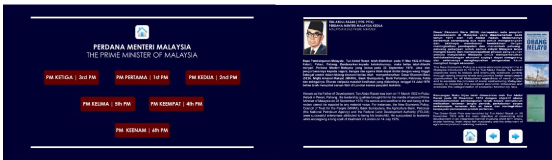
Figure 2. Interface of the current “The Prime Minister of Malaysia” application

The researcher decided to enhance one of the touch screens design, which is the “The Prime Minister of Malaysia” in National Museum. This application contains the biography and information about prime ministers of Malaysia. It was displayed in both English and Malay.