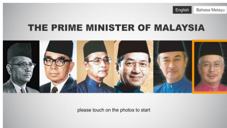
Figure 3. Modified main menu of “The Prime Minister of Malaysia”

Findings from preliminary studies show that multimedia elements which include layout, typography, colour, imagery and control, together with the ease of use are the most important design criteria that should be considered while producing interactive multimedia. Based on the main menu of the current interactive multimedia “The Prime Minister of Malaysia” application, the arrangements of the buttons are confusing, as the numbers are not in order. Apart from that, lack of images and design of the layout makes visitors lost interest. Besides that, there are too many words in one page as both Malay and English languages are used. There is no title or headlines to let visitors study to the point immediately. Other than that, every text is the same size, which is hard for users to read as well.